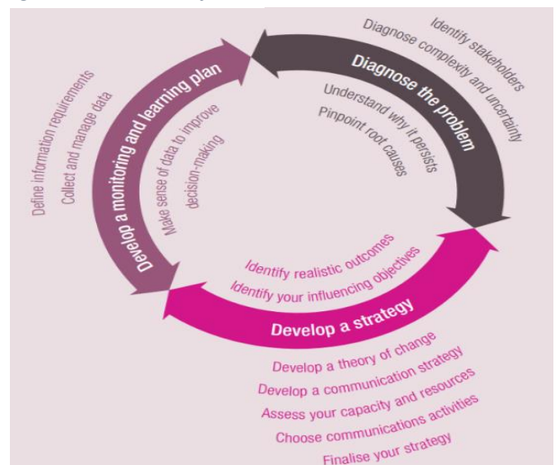
Figure 1: The ROMA Cycle